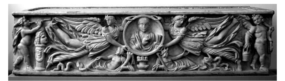
Fig. 1: Roman sarcophagus with flying Victories, carrying a portrait medallion. II-III c. AD, Pushkin Museum, Moscow

" \delta\delta\xi\alpha "<sup>21</sup>. Differences in meaning of both artistic devices had been clear enough until the moment, when Hesyshasm raised. The Hesyshastic mainstream has faded semantic distinctions between the nimbus as a symbol of the holiness and mandorla as a "meeting-point" of the material and the outer space<sup>22</sup>, and in late Palaiologan art mandorla became a visual sign of the uncreated Thaboric light, equal in meaning with the hallo .