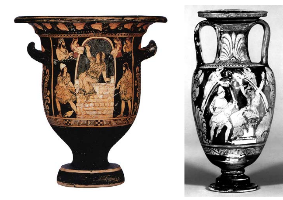
Fig. 2: Alkmene . Greek red-figure vase painting. Python. Later IV c. BC, British Museum, London