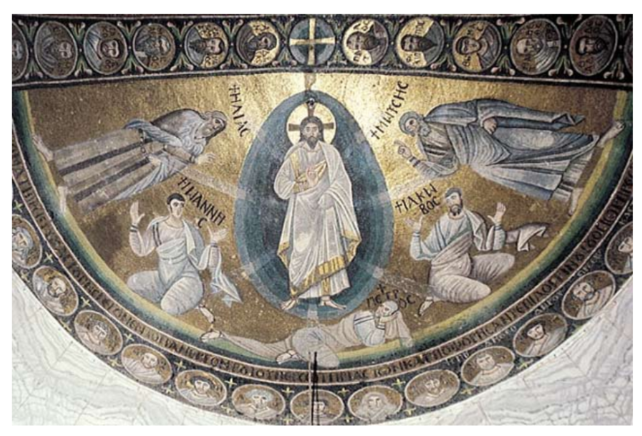
Fig. 8: Transfiguration . Apse mosaic, St. Catherine's Monastery, Mount Sinai, c. 550-565

different meanings from the very beginning. The oval one is more spatial and expresses the full significance of the Hebrew word Kabod , whose root meaning is 'weight, heaviness, richness' and unfolds the spatial manifestation of God's presence . The round one is more common to the second meaning of Kabod as 'glory, honor, and eminence'; in addition it is strongly related to the expression of the Divine Light as a visual sign of God's Energies.