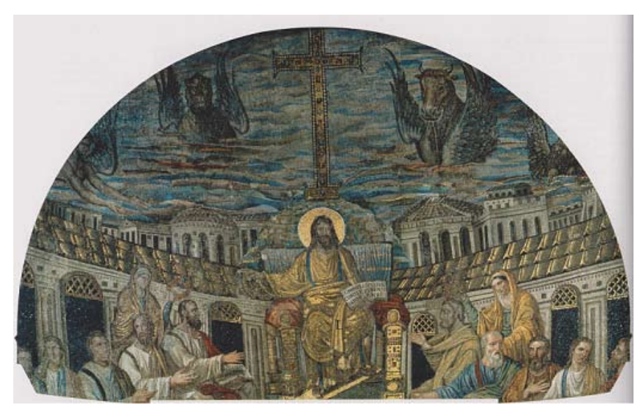
Fig. 5: Christ Enthroned among His Apostles. Apse mosaic, Santa Prudenziana, Rome, c. 415

sacred space. This esoteric symbol rapidly became very popular in the ancient art and its egg-like shape had been used for depicting the Cosmos and the birth of life, the feminine archetype of being<sup>33</sup>, etc. From Christian point of view vesica piscis represents together terrestrial and celestial<sup>34</sup>, humanity and divinity, which are inseparably bound together after the Christ Resurrection. First usage of this symbol among the early Christians can be seen in the fish shape " I\chi\theta \delta \varsigma " – the hidden pictogram of Christianity, used during the first centuries AD<sup>35</sup>. In the end of the fourth century and in the beginning of the fifth century AD the mandorla has found its usage in the Early Christian art as an artistic device, circumscribing Christ's figure.