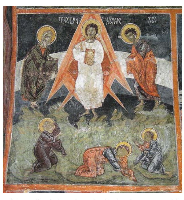
Fig. 11: Transfiguration. Fresco, St.Theodor Tiron and St. Theodor Stratilat Church, Dobarsko, c. 1614

the laic interpretations of the wall paintings from the St. Theodor Tiron and St. Theodor Stratilat Church in Dobarsko ( Fig. 11 ), made in 1614 AD)<sup>68</sup>. Such kind of paintings can be seen in a few Bulgarian churches from the same time, but the question about their precise scientific investigation is still open.